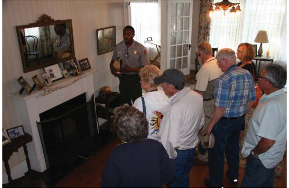
CHILDHOOD HOME - Caravaners listen as a park employee explains the photographs on the living room fireplace mantle in Bill Clinton's grandparent's home.

"I was particularly pleased (and relieved) with the level of cooperation of