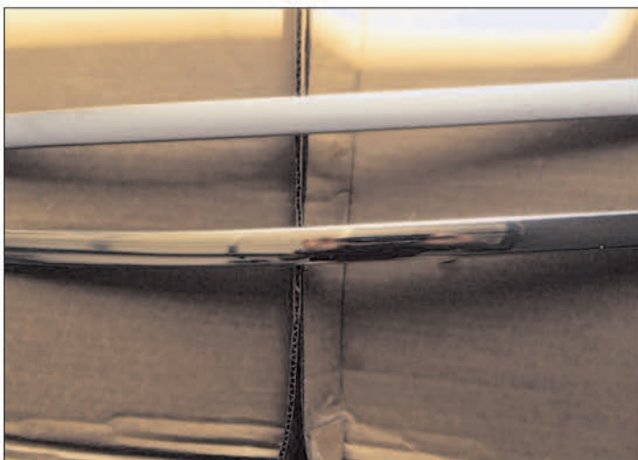
OLD VERSUS NEW - The old rub rail at top is dull gray. The new piece is as shiny as a mirror.