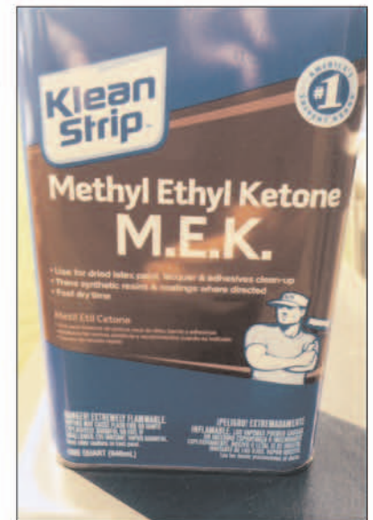
M.E.K. - Cleans airplanes and Airstreams. For protection, use gloves and a respirator.

tape, then press-fitting it into the extrusion. Wow! What a difference a little “bling” can make to enhance the beauty of your Airstream.